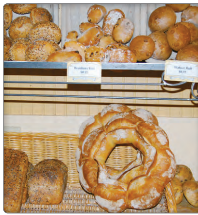
St Honoré Boulangerie not only makes gorgeous bread, but also great espresso.

to leave. In addition to the gripping novel of cheese, 25 to 30 alluring charcuteries will distract. Especially the Pata Negra.