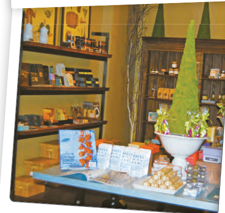
Cacao is a serious chocolate lover's paradise with bars and drinking chocolate.