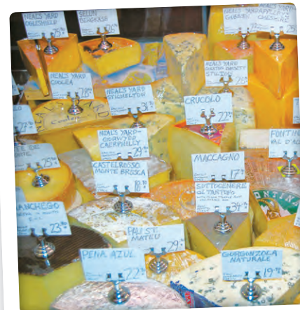
Steve's Cheese (inside The Square Deal Wine Shop) you'll find wheels and charcuterie.