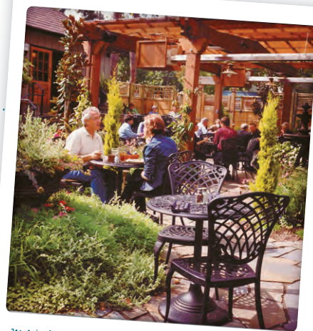
Meriwether's on N.W. Thurman has an elegant patio and an equally exquisite menu.